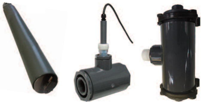
Sensor with cleaning wiper Flow Through Assembly Debubbler Assembly

The Triton TR80 uses a nephelometric 90° NIR scattered light optical method for determining turbidity or suspended solids. A light beam is directed into the sample where it is scattered by suspended particles in the water. The amount of scattering depends on the amount of material in the water, the wavelength of light used and the size and composition of the suspended particles. Designed for use in environmental, water treatment, or drinking water, the Triton TR80 is suitable for most aqueous applications. It is not suitable for use in organic solvents or in solutions with an extreme pH value, only use when the pH is between 2-12 pH. The temperature range for the sensor is 0° to 50°C. Turbidity, the cloudiness or haziness of a water sample, is caused by particles suspended in the water, typically clay and silt. Since bacteria and viruses can be attached to these particles, turbidity has become a critical indicator of the overall water quality.