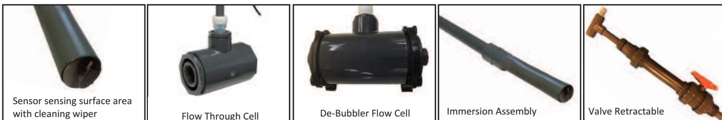
Sensor sensing surface area with cleaning wiper

The TR80 Turbidity Sensor is easy to install, it is easy to use with NTU factory calibration, it is Plug and Play. With the rugged construction including a rugged optical window, self monitoring diagnostics and nephelometric 90° NIR scattered measurement method, the TR80 Turbidity sensor with wiper is reliable, accurate and requires minimal maintenance, it is the solution.