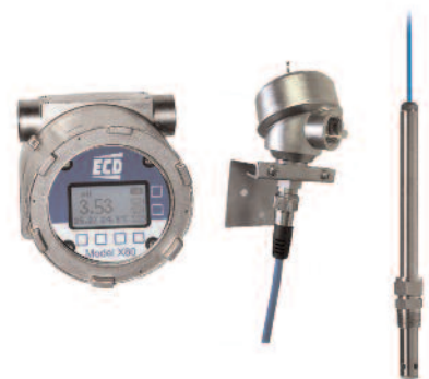
X80 Transmitter, B88 Barrier and S88 Sensors

The Model X80 Transmitter features a large easily viewed LCD display. Loop powered instruments have Black lettering on a Grey background, while the 24