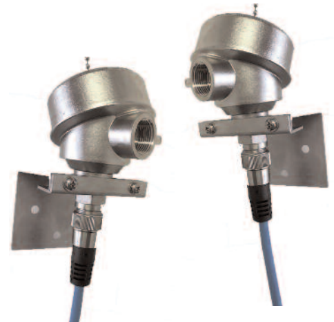
B88 Barrier for Class I, Div 1, Groups B, C and D Class I, Zone 1 IIB+H 2 T5