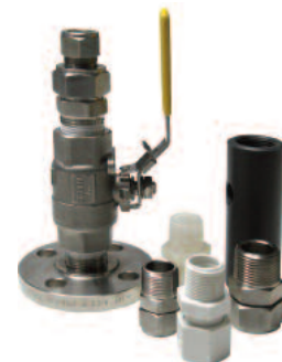
Optional Sensor Process Fittings