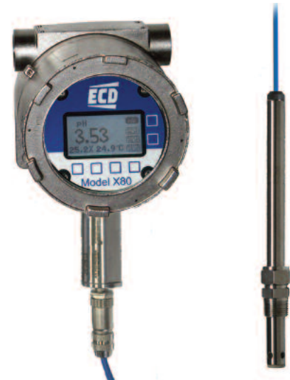
ATEX / IECEx Approved X80 Transmitter and S88 Sensors

The Model X80 Transmitter features a large easily viewed LCD display. Loop powered instruments have Black lettering on a Grey background, while the 24 VDC powered instruments have blue lettering on a white background when the LED backlight is on. The Model X80 has three easily switchable Main Display screens; the Data Screen, the Millivolt Screen and the Graphical Display screen. (six screens for two channel units) The Data Screen displays the