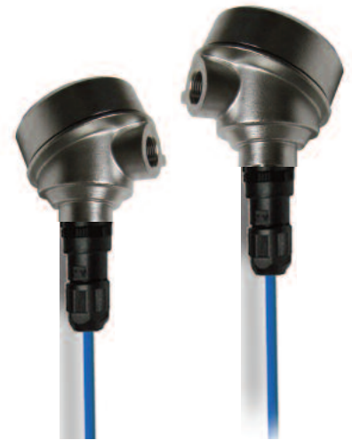
S88 Sensors for Class I, Div 1, Groups B, C and D