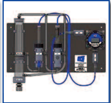
Model FCX80 Free Chlorine Analyzer for Hazardous Locations