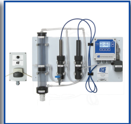
Model DC-80 De-Chlorination Analyzer