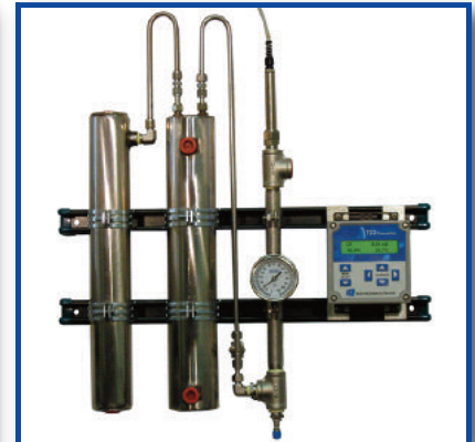
Model 61 Boiler Blowdown System