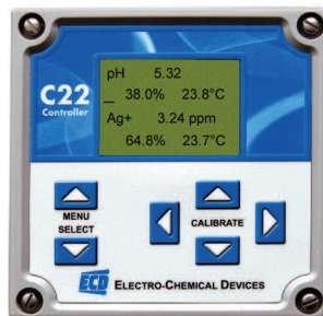
Model C22 Analyzer