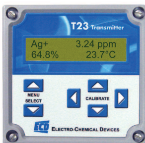
Model T23 Transmitter

In many cases the process solution's ionic strength, temperature and pH value will differ widely from the calibration solution. These factors will affect the zero potential of the chloride sensor causing an offset, but they will typically not affect the slope. To eliminate the offset perform a standardization, a single point in-line calibration. Once the sensor has stabilized in the process solution take a grab sample from the process and determine the silver ion concentration. Adjust the analyzer to read this laboratory determined value. It is recommended to verify the readings on a weekly basis.