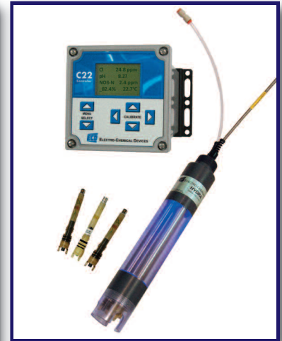
HYDRA ® NO 3 -N