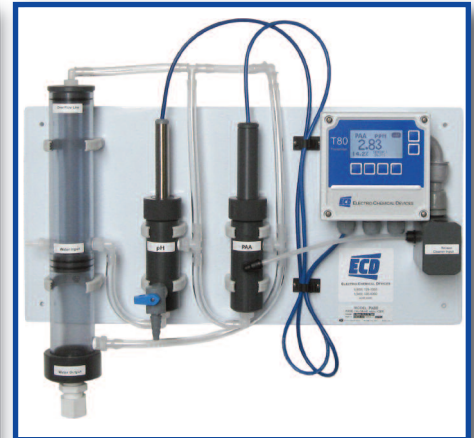
Model PA80 Peracetic Acid Analyzer